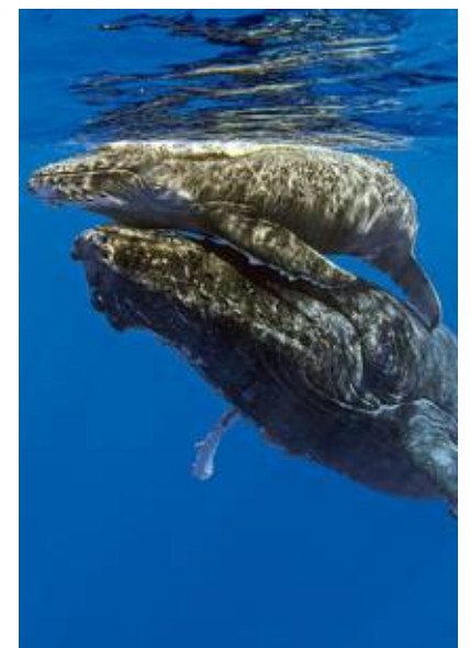
Whales help phytoplankton thrive and capture atmospheric carbon

Here's a pop quiz. What is the earth's biggest carbon sink? Nope, it's not forests, or peatland. It's that body of water that covers 71% of our planet's surface: the ocean. Three billion people depend on its ecosystems for food and economic security. It also mitigates climate change, having absorbed 93% of the heat trapped by greenhouse gases and about 30% of the CO 2 emitted by burning fossil fuels so far. If we didn't have the ocean, we'd be much worse off. In return, humankind has polluted the oceans with oil, sewage and plastic. We've plundered our waters, harvesting fish stocks to depletion, tearing up the seabed with trawl nets and mining deep-sea mineral deposits. Noisy and polluting vessels plough across waters and sometimes into marine creatures.