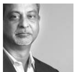
is a policy consultant and a senior journalist. His Twitter handle is @rajrishisinghal.

The palpable tension at the conclusion of two recent G20 meetings holds pointers to the possible path ahead for India's geo-economics. If reports emerging from the meeting of finance ministers and central bank governors in Bengaluru (24-25 February) and the foreign ministers meeting in Delhi (1-2 March) are anything to go by, one of India's key building blocks for future economic growth, foreign trade, might face renewed challenges.